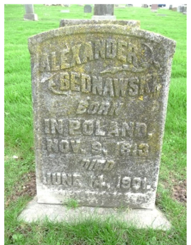
ALEXANDER BEDNAWSKI BORN IN POLAND NOV. 9, 1813 DIED JUNE 14, 1901