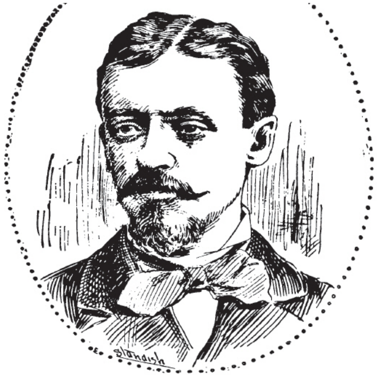
Henry Sienkiewicz as He Was When in California.