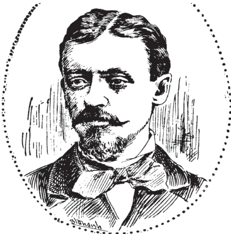
Henry Sienkiewicz as He Was When in California.