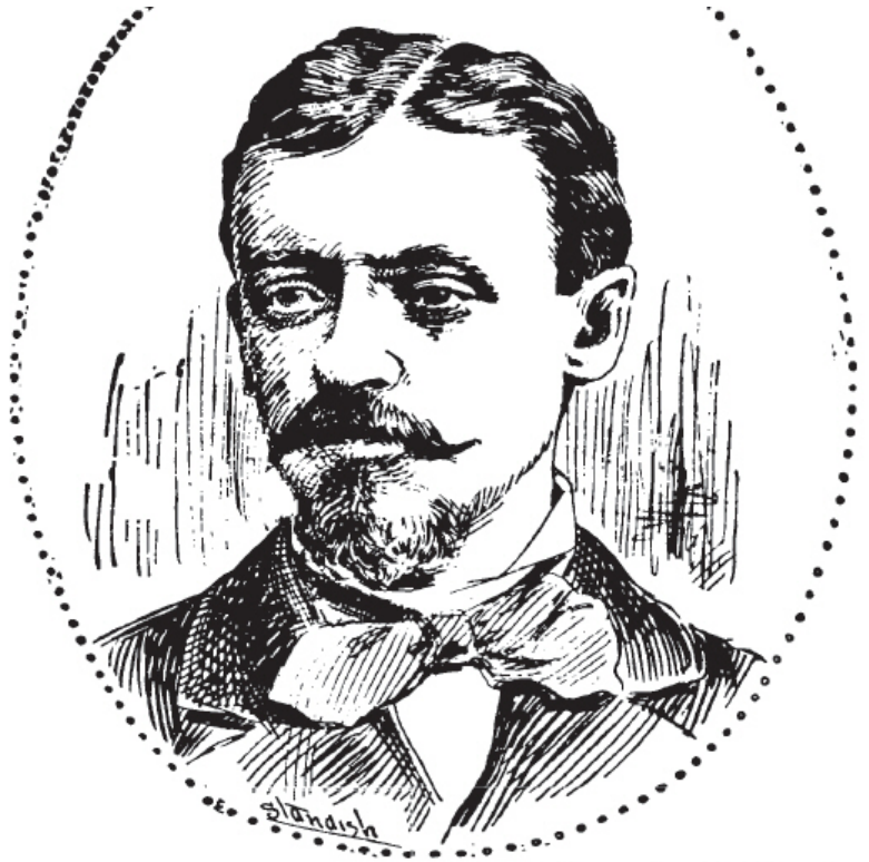
Henryk Sienkiewicz as He Was When in California.