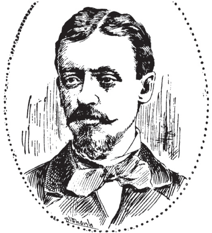
Henry Sienkiewicz as He Was When in California.