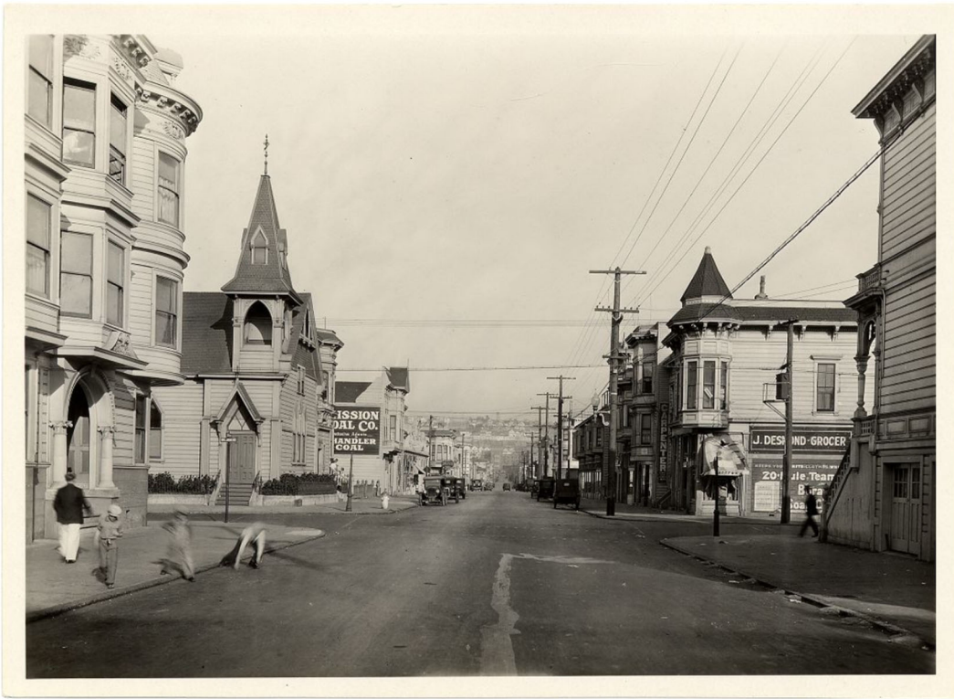
1929, SF Public Library Photo